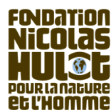
Fondation Nicolas Hulot pour la nature et l'homme