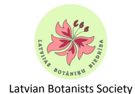
Latvian Botanists Society