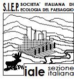
SOCIETA' ITALIANA DI ECOLOGIA DEL PAESAGGIO