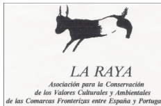
Asociación La Raya