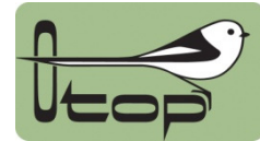
Polish Society for the Protection of Birds