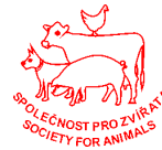
Společnost pro zvířata