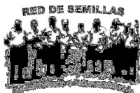
Red de Semillas: Resembrando e Intercambiando