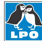
Ligue pour la Protection des Oiseaux