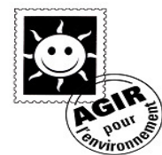
Agir pour l'Environnement