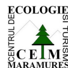
Asociația Centrul de Ecologie și Turism Maramures