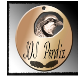
SOS Perdiz Roja