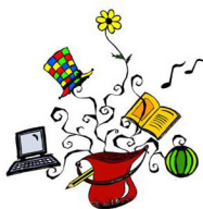
Asociación Cultural Caldero Mágico