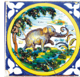
Plataforma en Defensa de los Ríos Tajo y Alberche de Talavera de La Reina