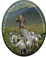
Asociación Pastores por el Monte Mediterráneo